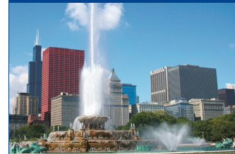
Guided Tour of Chicago