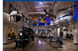
Explore the Museum of Science and Industry

Departure: Masonic Fellowship Hall, 1114 Oxmead Rd, Burlington, NJ @ 8 am