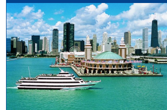
Enjoy a Skyline Cruise on Lake Michigan